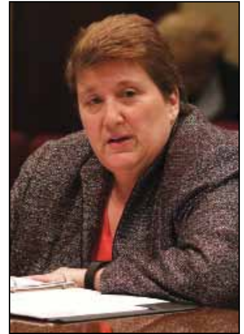
Sen. Laura Ebke (L–Nebraska)

Kentucky: At a May 11 conference, the U.S. Supreme Court refused to hear Libertarian Party of Kentucky v. Grimes , 16-1034. The issue was the state’s definition of a qualified party. To remain ballot-qualified, Libertarians will need to again receive at least 2 percent of the vote in the presidential election.