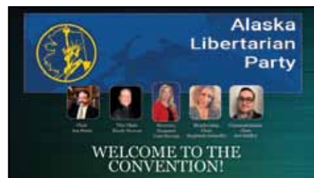
LP Alaska convention promotional material